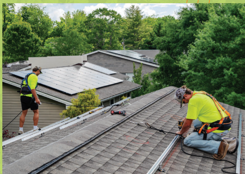
A community of retirees in Southwest Virginia had solar energy installed in 2025 to reduce costs for its lowest-income renters. The ElderSpirit project is one of dozens we've helped make a reality through the Appalachian Solar Finance Fund.