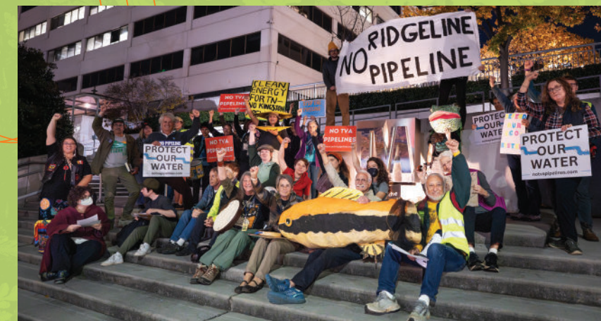
Opponents of the Ridgeline methane-gas pipeline gathered at the Tennessee Valley Authority's headquarters. As TVA doubles down on fossil fuels, we are working to protect communities and keep the public in public power.