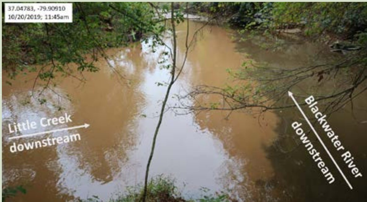
Heavy sediment from Little Creek flows into the Blackwater River in October 2019. Little Creek is crossed several times by the Mountain Valley Pipeline in Franklin County, Va.

Sedimentation has also impacted local road access, with an acute example occurring after significant rainfall in May 2018, when Cahas Mountain Road in Boones Mill, Franklin County, Virginia, was blocked and shut down by about a foot of mud escaping from the construction site. 69