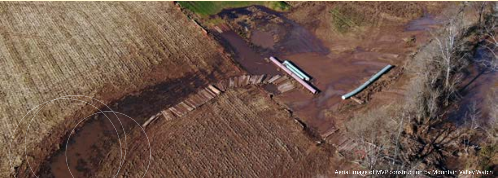
Aerial image of MVP construction by Mountain Valley Watch