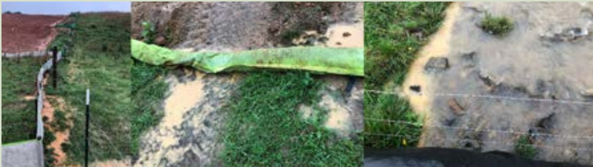
From left to right: Failed erosion and sediment control along the MVP route in Giles County, Va., during MVP construction in October 2018. Sediment escapes the construction site through failed sediment control measures. A stream is impacted by sediment deposition and increased streambank erosion.

As listed in Virginia's 2018 legal complaint, the office of the Virginia Attorney General alleged 375 violations , including hundreds of water quality protection violations. 56 The violations include unpermitted discharges into waterways, failure to maintain and repair erosion and sediment controls, violations related to road crossings over streams, and violations related to water diversions and drains. That matter was resolved with a negotiated consent decree, or settlement, which required MVP to pay a $2.15 million penalty and pay for third-party environmental auditing going forward. 57 Since the consent decree was entered in 2019, Virginia DEQ has cited MVP, LLC, for an additional 51 violations. 58