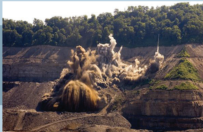
Blast at Surface Mine on Shumate Branch, West Virginia

But mountaintop removal is not necessary to meet America's energy needs –it accounts for less than 10% of US coal production .