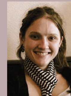
APRIL 6, 1985 - APRIL 23, 2010